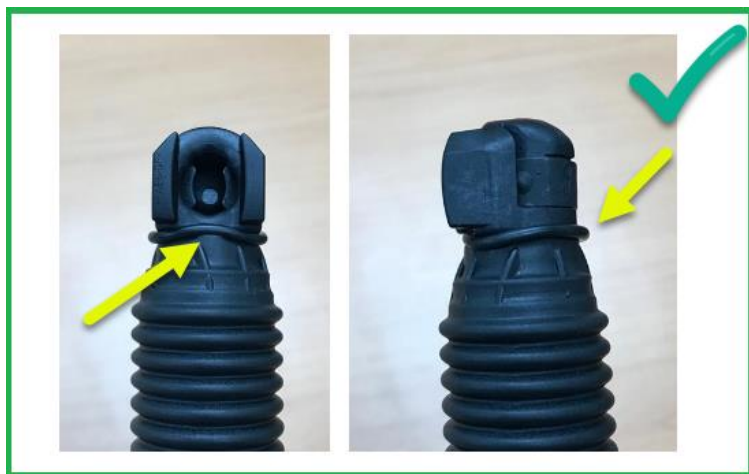
Figure 4 – O-ring seated correctly

⚠ CAUTION: Make sure that you install the correct O-ring with part number 1831785-00-A.