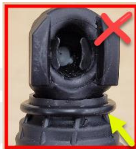
Figure 5 - O-ring seated too low